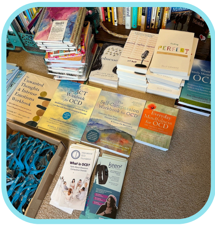
Collecting donations for Not Alone Totes